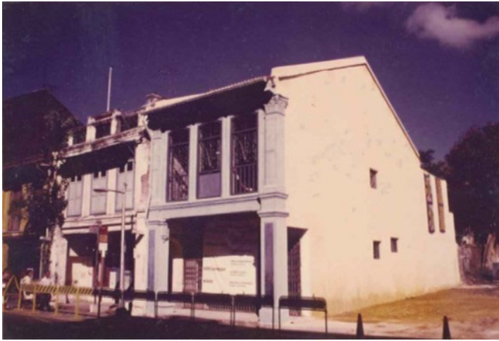
The restored Armenian Street shophouse

Rather than using powered tools, traditional conservation techniques – such as that used on historic buildings in France – were employed in the restoration of the shophouse. Seven layers of paint and cement cladding from the side of the shophouse were stripped off and replaced with porous mortar. The roof was also replaced with exact copies of the traditionally used V-shaped tiles, which were made in France.