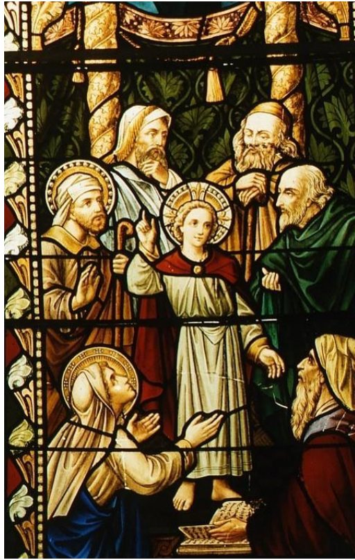
One of the CHIJMES' stained glass windows restored

Under his advice, the scale of the restoration and its sensitivity to the original structure and history of the iconic building were eventually what clinched CHIJMES the Architectural Heritage Award in 1997.